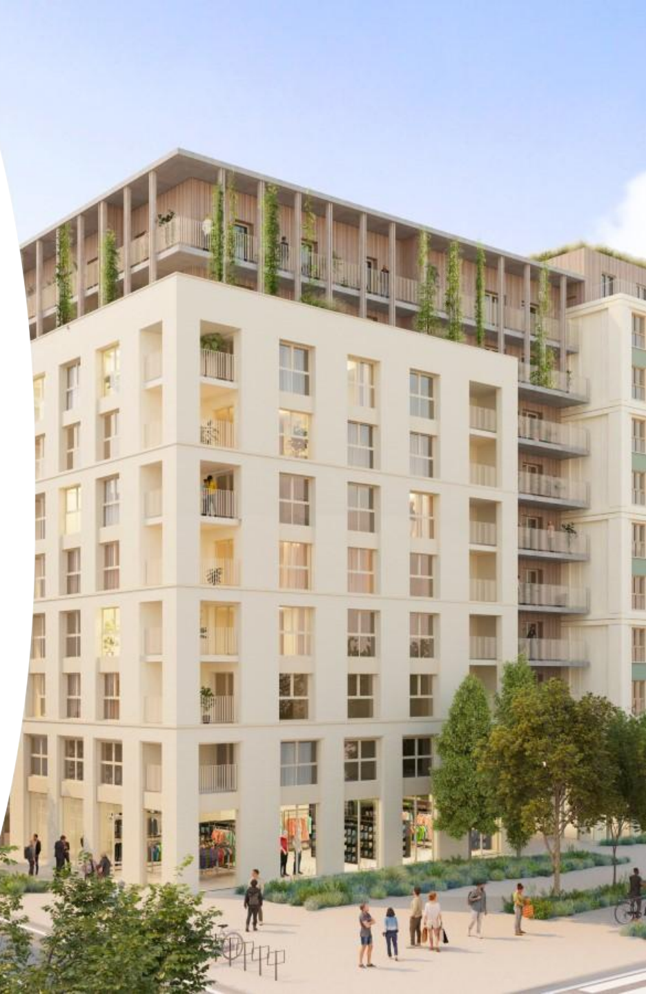
Bellvédère - Bordeaux (33)