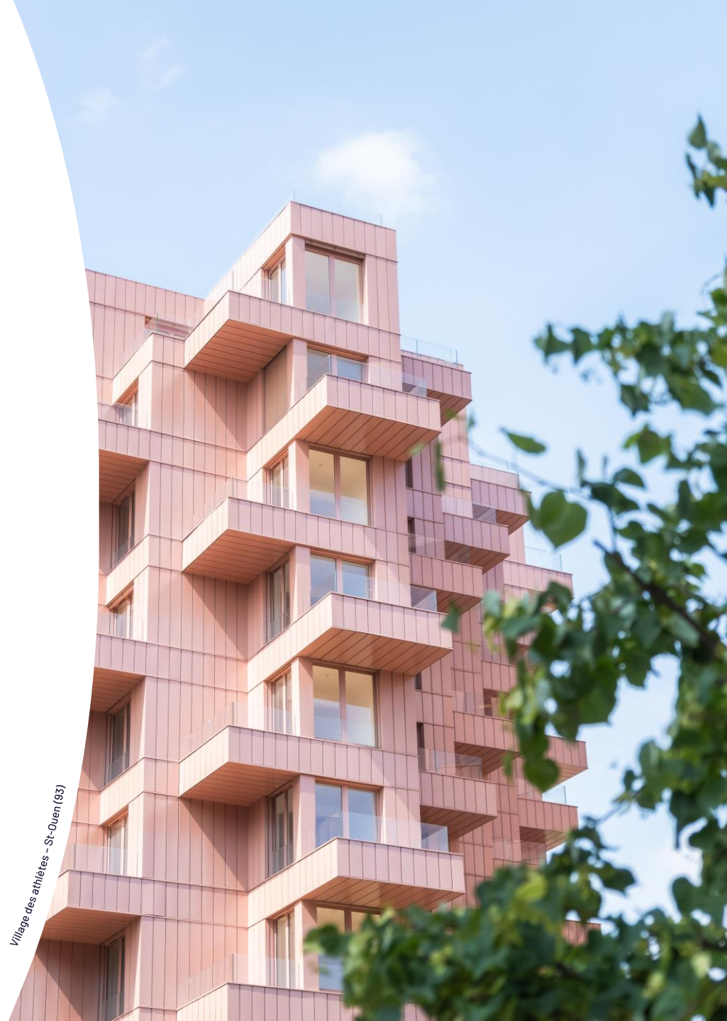
Village des athlètes - St-Ouen (93)